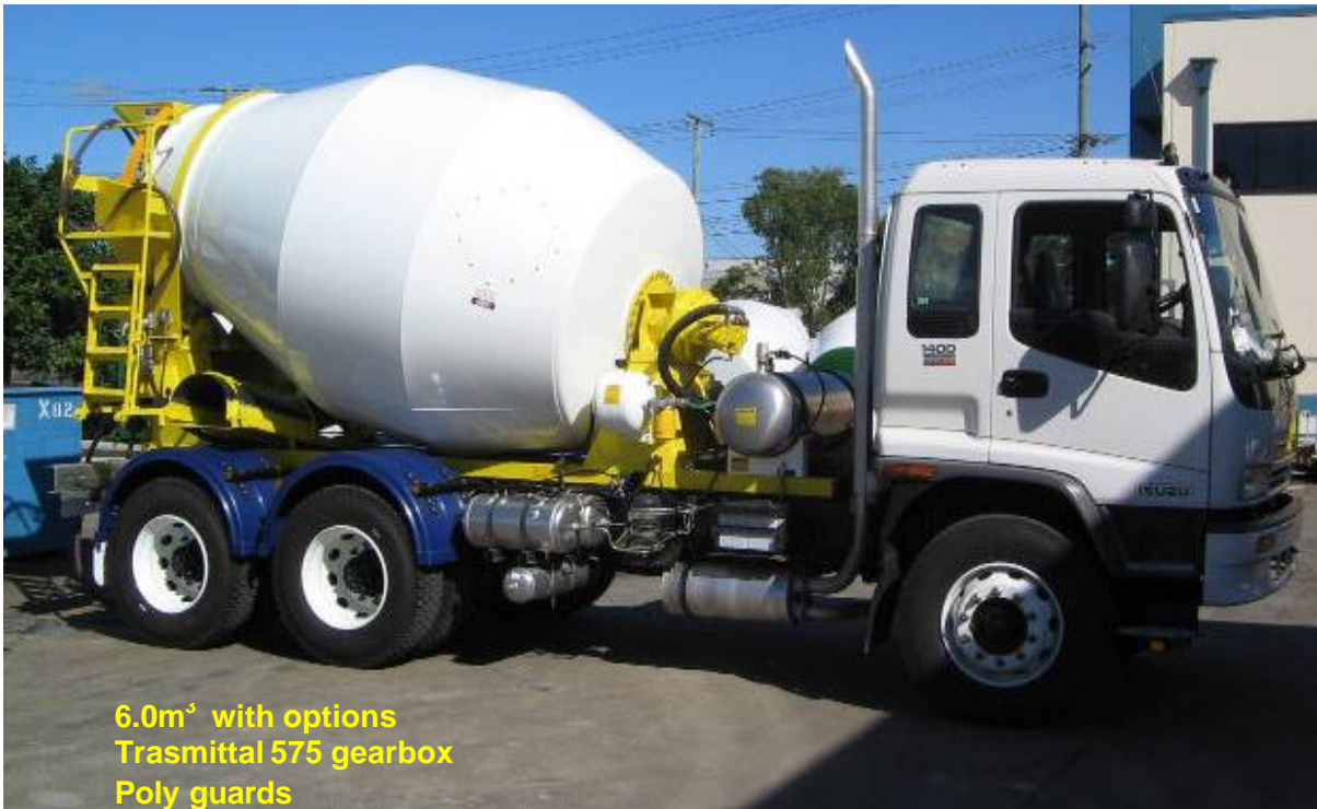
6.0m 3 with options Trasmittal 575 gearbox Poly guards